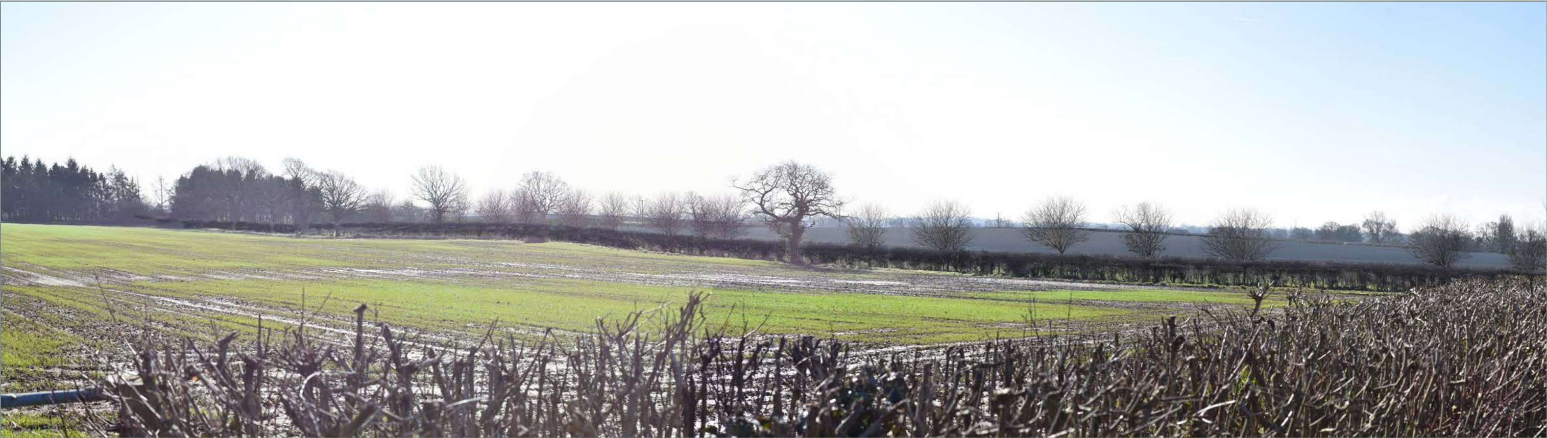
Render view Year 15