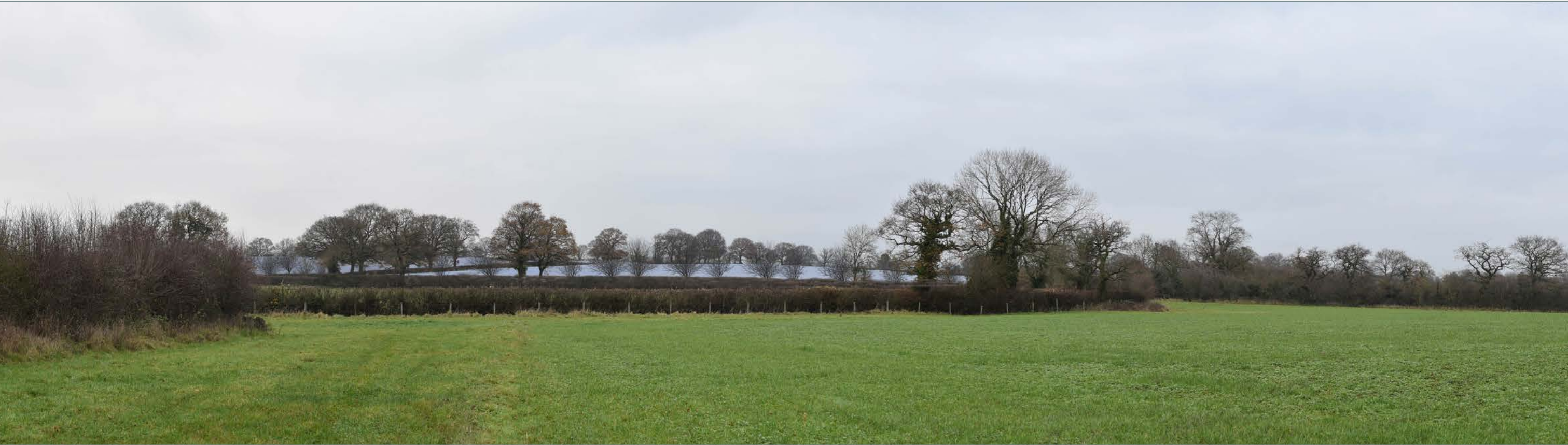
Render view Year 15