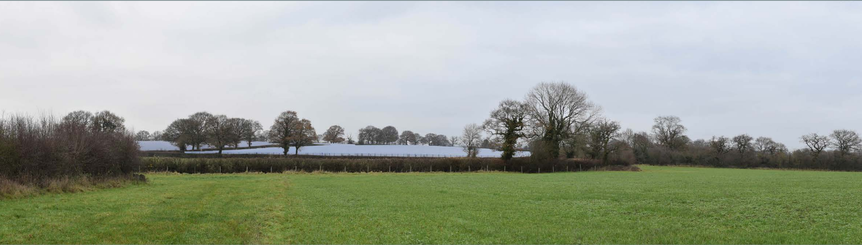
Render view Year 1

S:\PROJECTS\3250 - 3299\3255 - Land at Newlands Farm\3 GRAPHICS\INDESIGN\3255_Land at Newlands Farm_Visualisations.indd