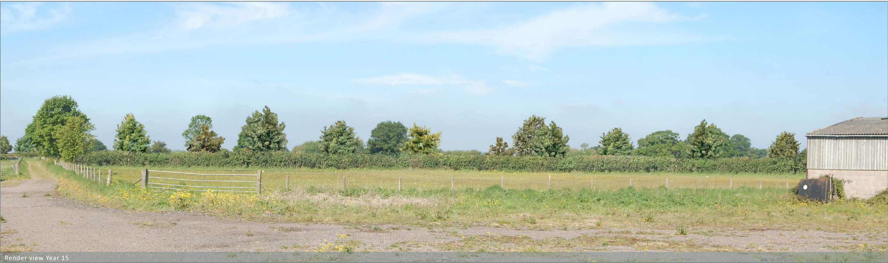
Render view Year 15