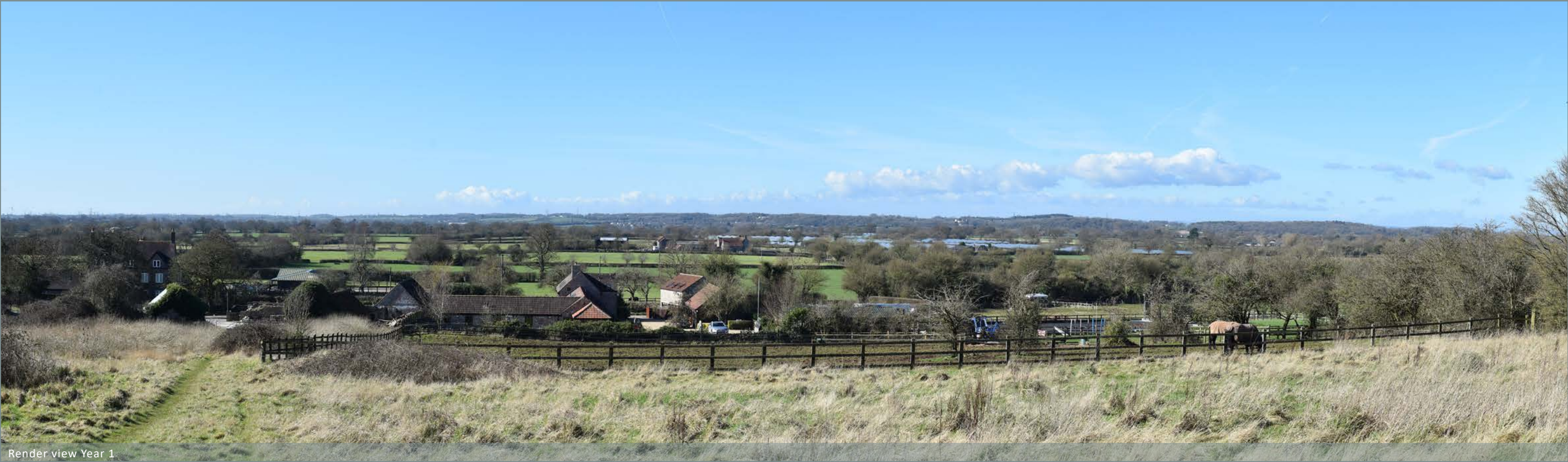
Render view Year 1

S:\PROJECTS\3250 - 3299\3255 - Land at Newlands Farm\3 GRAPHICS\INDESIGN\3255_Land at Newlands Farm_Visualisations.indd