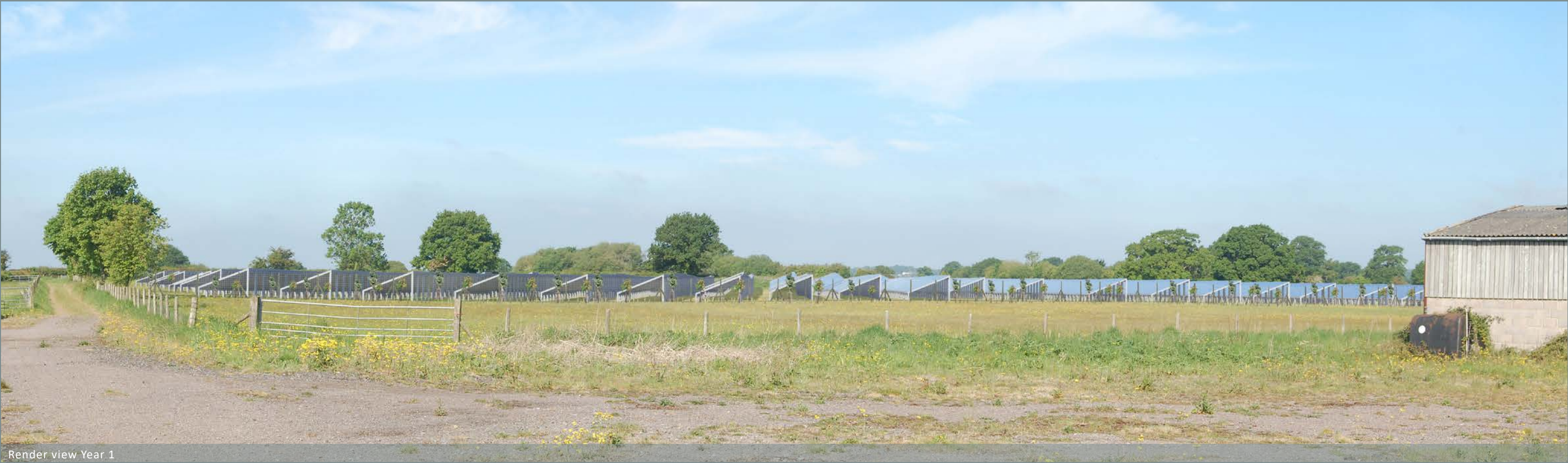
Render view Year 1

S:\PROJECTS\3250 - 3299\3255 - Land at Newlands Farm\3 GRAPHICS\INDESIGN\3255_Land at Newlands Farm_Visualisations.indd