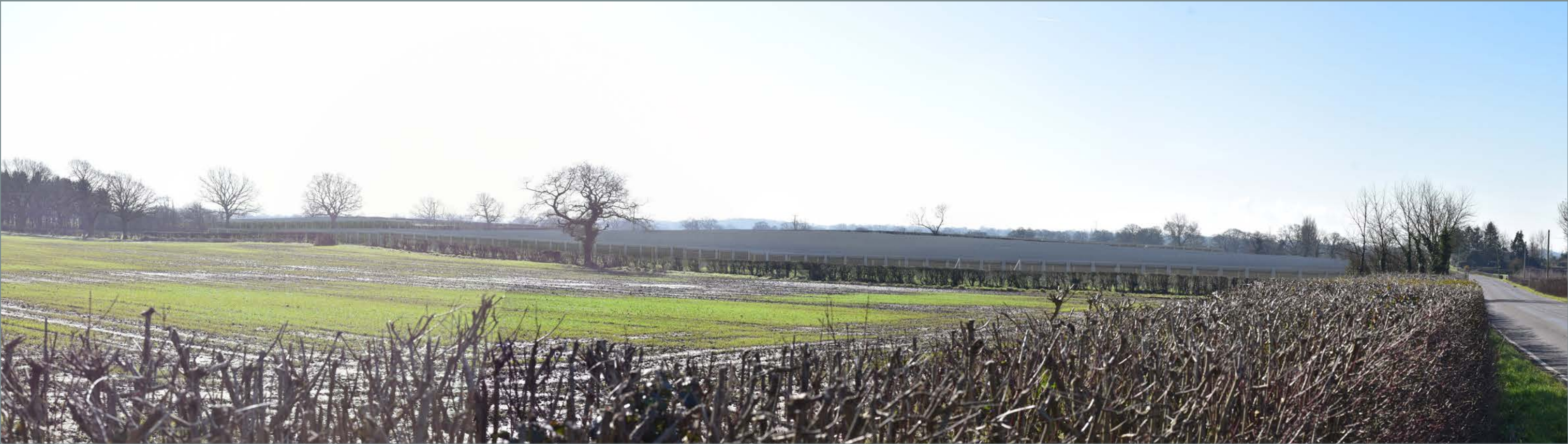
Render view Year 1

S:\PROJECTS\3250 - 3299\3255 - Land at Newlands Farm\3 GRAPHICS\INDESIGN\3255_Land at Newlands Farm_Visualisations.indd